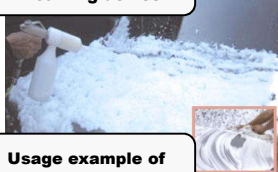
Usage example of air mousse gun