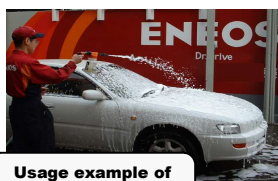
Usage example of foaming device

■sap ■car body ■concentration : 5% dilute ■placing time : 1 min.