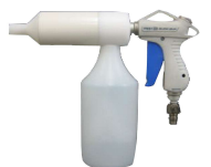
Air type mousse gun