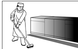
Use deck brush