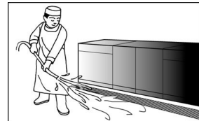
Rinse with water after brushing