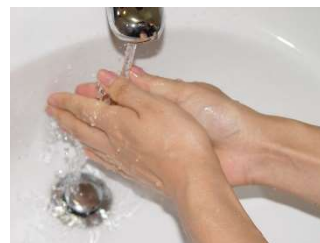
Rinse with running water