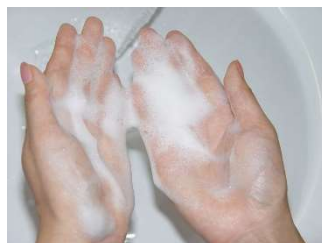
Foam and wash