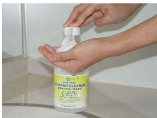
Pump appropriate amount