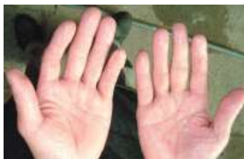
"so beautiful hand washing after work, I can comfortably eat my meal"