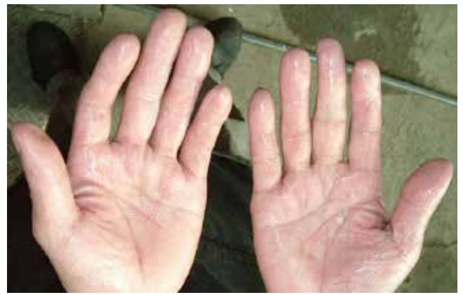
The dirt is removed well and his hands are moisturized