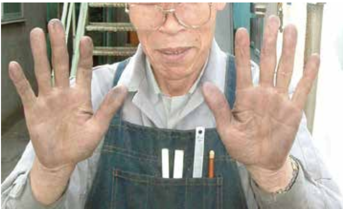
Over the years, the dirt has not been removed from the fingerprints