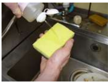
Washing bowl and dishes

■oil ■dishes ■concentration: 100% ■soaking time: 0 min.