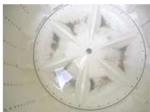
Immediately after washing