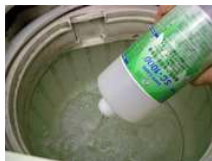
E-CLEAN(SC) stock solution input